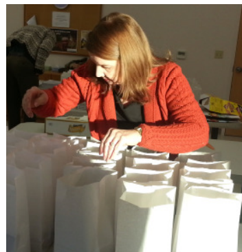
Happy New Year! Volunteers began the new year by making bagged lunches for the homeless.