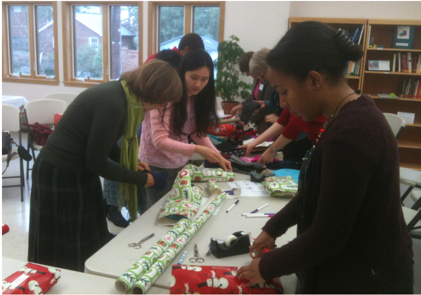
Sharing our gifts. Last year members wrapped gifts of warm socks, scarves and hats for the homeless. This year we purchased clothing and toys for our adopted family.