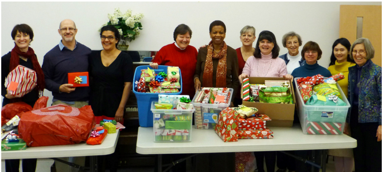
Advent's elves. Our Christmas gifts made for a wonderful holiday for low-income families served by APAH.